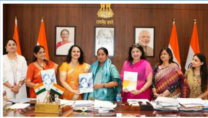
NAREDCO Mahi Leadership Met Smt. Rekha Gupta Hon'ble Delhi Chief Minister, Govt. of NCT of Delhi