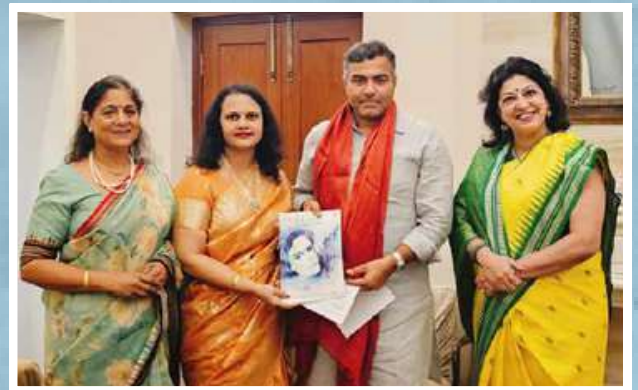
NAREDCO Mahi Leadership Met Shri Pravesh Verma, Hon'ble Cabinet Minister, Govt. of NCT of Delhi