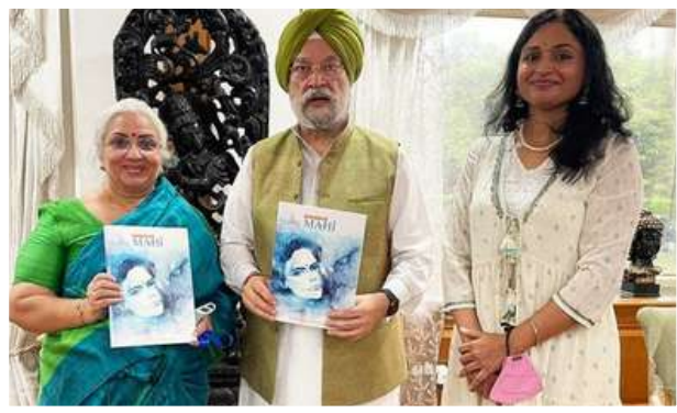
NAREDCO Mahi leadership with Shri Hardeep Singh Puri, Former Hon'ble Minister of Housing and Urban Affairs, Govt. of India